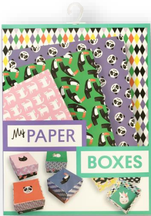
Illustrated by Cynthia Thiéry

Brand-new activity sets with an arts-and-crafts theme: each book includes full instructions and comes with all the paper tools children will need.