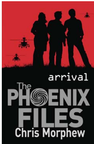
THE PHOENIX FILES BOOK 1, ARRIVAL